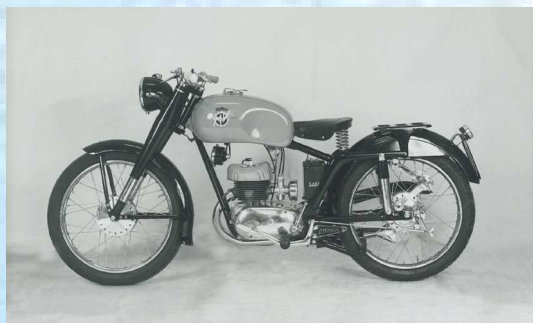
MV 150 Turismo TEL - 1953

The law concerning motorcycles in Italy changed, and as of 1951 125cc bikes were forced to have a license plate. This opened the market to larger displacement motorcycles. The 150 represents a step forward in performance and reliability and was sold in decent numbers. To increase the range, the "TEL" (Turismo E Lusso) variant was also produced.