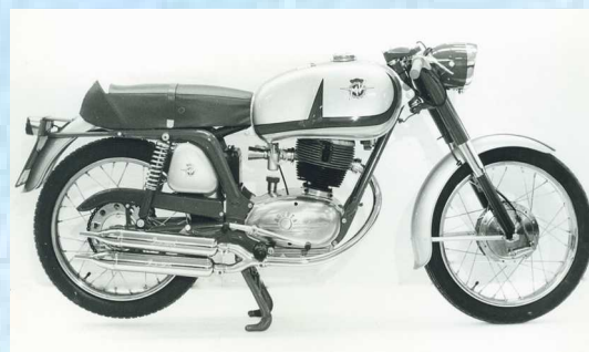
MV 150 Sport "RS" - 1967