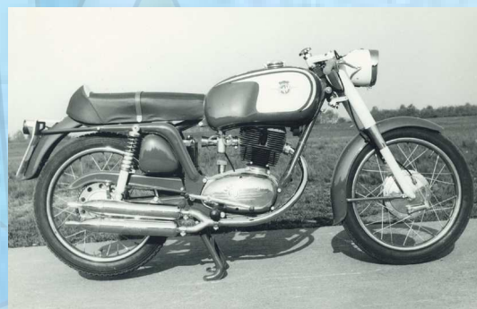
MV 150 Sport "RS" - 1963