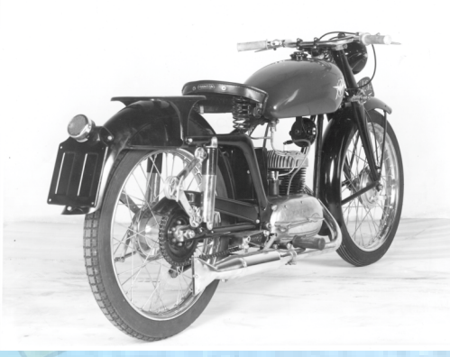
MV 125 Turismo "D" - 1952