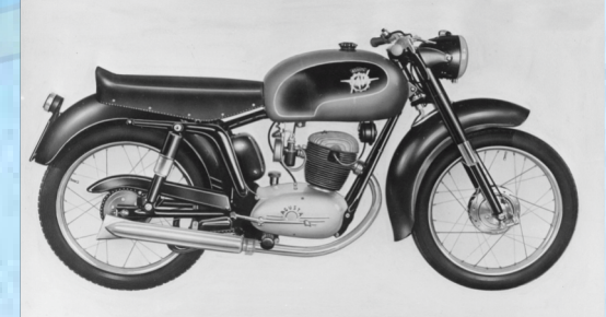
MV 125 Turismo TRL - 1957