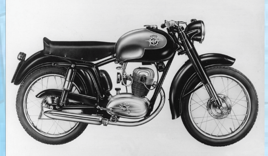
MV 125 Turismo Rapido - 1956