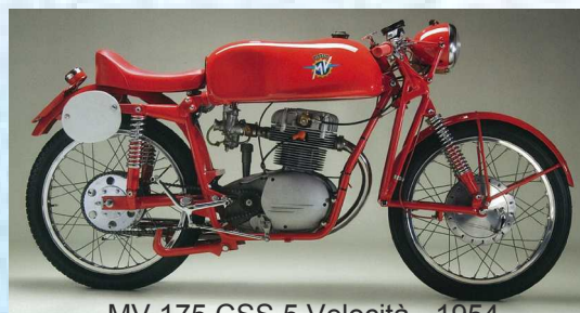
MV 175 CSS 5 Velocità - 1954