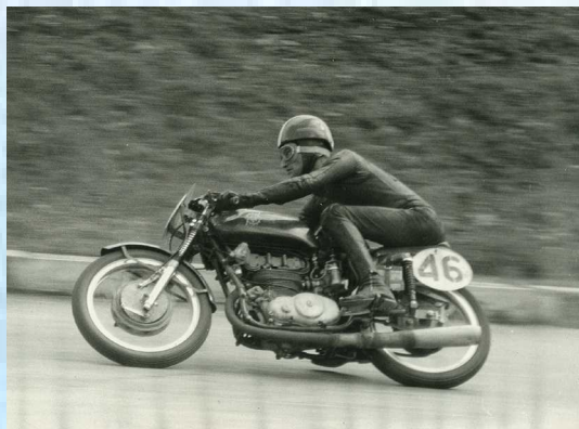
MV 250 Bialbero - 1958 Il pilota Tarquinio Provini