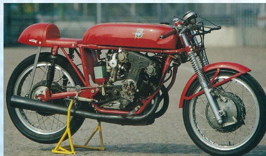
MV 250 Bicilindrico - 1959