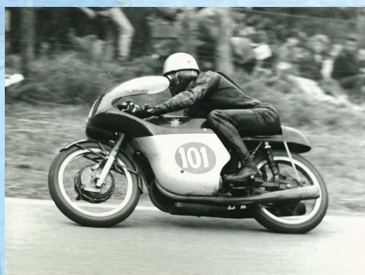
G. Hocking winner in France G.P. on MV 285 cc. bicilinder class 350 - 1960