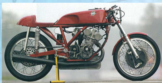
MV 350 3 cilindri - 1968