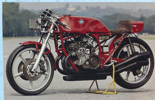
MV 350 4 cilindri - Versione 1974