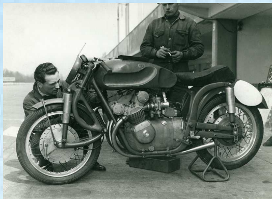
MV 500 4 cilindri "Cardano" - 1952 con forcella "Earles"