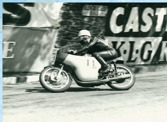
MV 125 Bialbero - 1958 Carlo Ubbiali