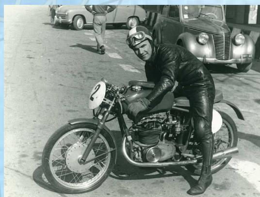
MV 125 bialbero - 1953 Carlo Ubbiali