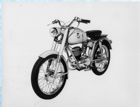
MV 50 Liberty Turismo 16" - 1962