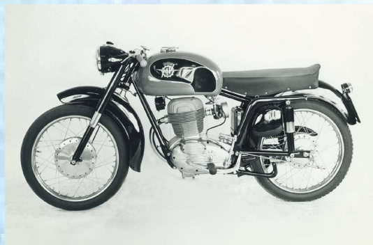
MV 175 Turismo CSGT - 1957

Top speed: 100 Km/h Consumption: 34 Km/l