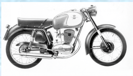
MV 125 Turismo TREL - 1957