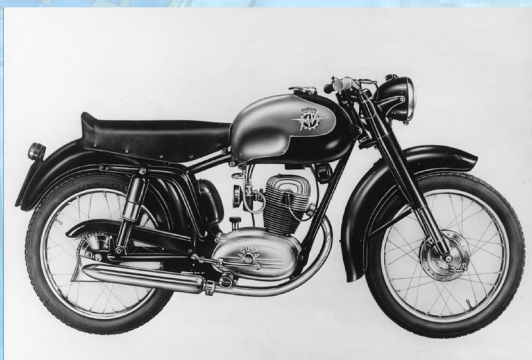
MV 125 Turismo Rapido - 1956