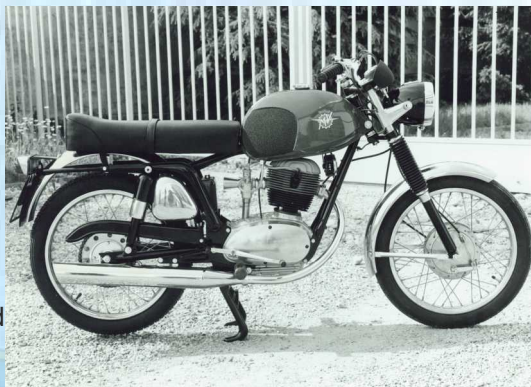
MV 125 Turismo GT - 1970

The "GT" was an evolution of the 125 from 1966. The engine crank case was redesigned and a rev counter was added. The aesthetics were profoundly different, the lines were straight, especially the rectangular gas tank and the straight highlight that ran along it. The shape of the exhaust was new as well, the handlebars were raised and the general configuration was of a touring bike.