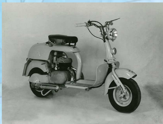
MV 125 Scooter 052 - 1952